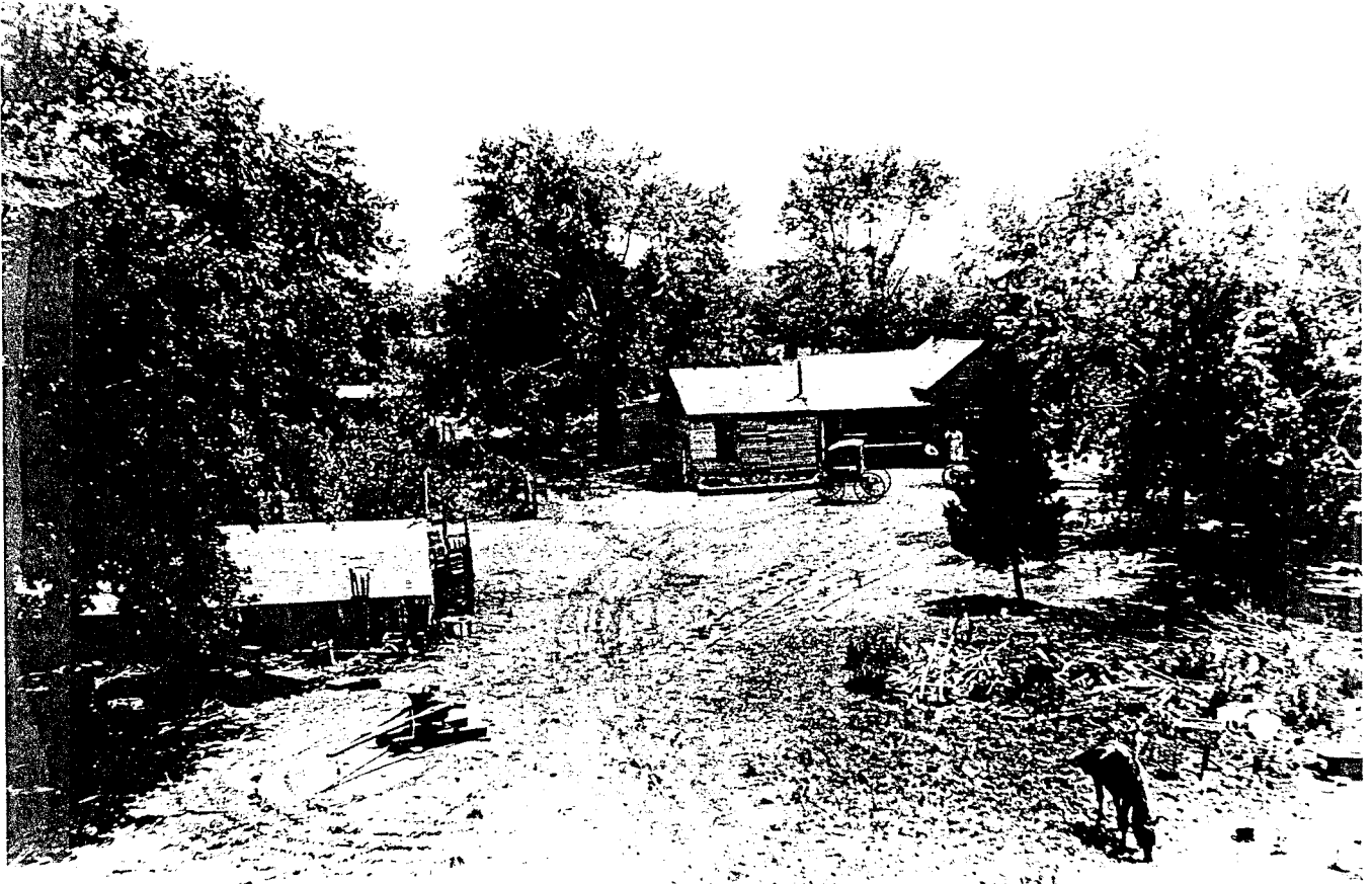
The original homestead on the 100 acre farm.